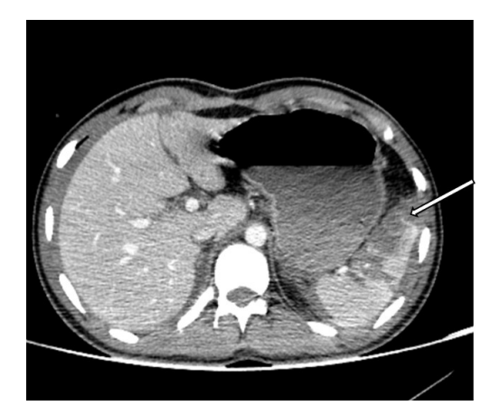
Figure 3. A 50-year-old male patient with road traffic accident. CECT abdomen venous phase image showing a laceration > 3 cm (white arrow) subcapsular hematoma s/o grade III splenic injury.