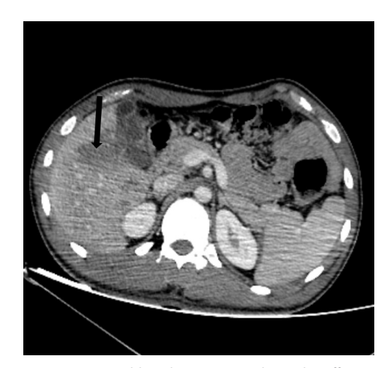
Figure 2. A 48-year-old male patient with road traffic accident. CECT abdomen venous phase image showing a laceration > 3cm in segment 5 of liver (black arrow) s/o grade III hepatic injury.

There was significant association of anorectal injuries (P=0.003) and bladder/urethral injuries with pelvic fractures (P<0.001). Previous studies have also shown significant association of pelvic fractures with bladder urethral, small bowel and liver injuries (17). We could not find any significant association of pelvic fractures