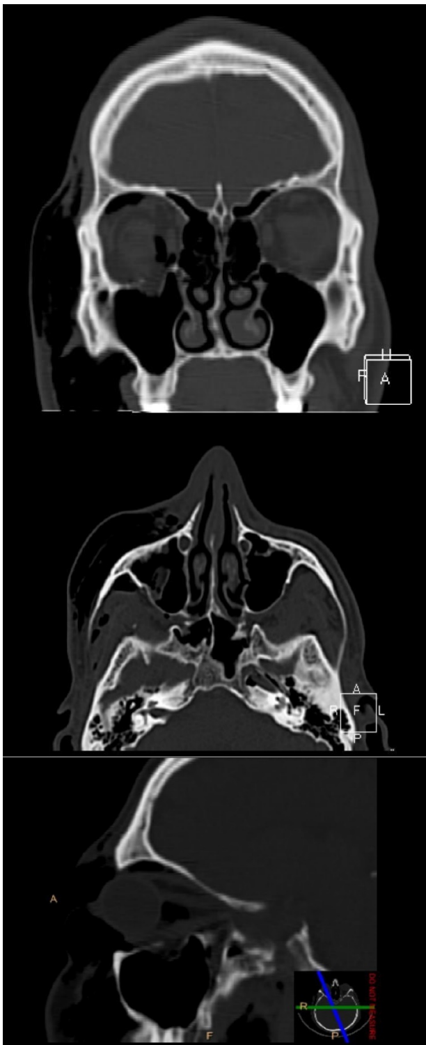
Figure 1. Coronal, Axial and sagittal bone window computed tomography of the face demonstrates mildly displaced orbital floor fracture, subcutaneous air in the right orbit as well as extensive right premaxillary and peri-orbital soft tissue.

dyspnea and acute severe progressive epigastric pain. On examination, there was tachypnea and moderate shortness of breath. The symptoms progressed rapidly, so we decided to intubate the patient given that dyspnea and emphysema were progressing and the patient was symptomatic. After the intubation (30 minutes later), ventricular tachycardia