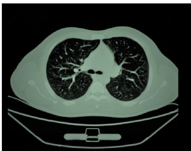
Figure 3. Axial CT of the chest, lung window at the level of upper mediastinum demonstrated resolution of pneumomediastinum.

and parapharyngeal areas to the mediastinum.