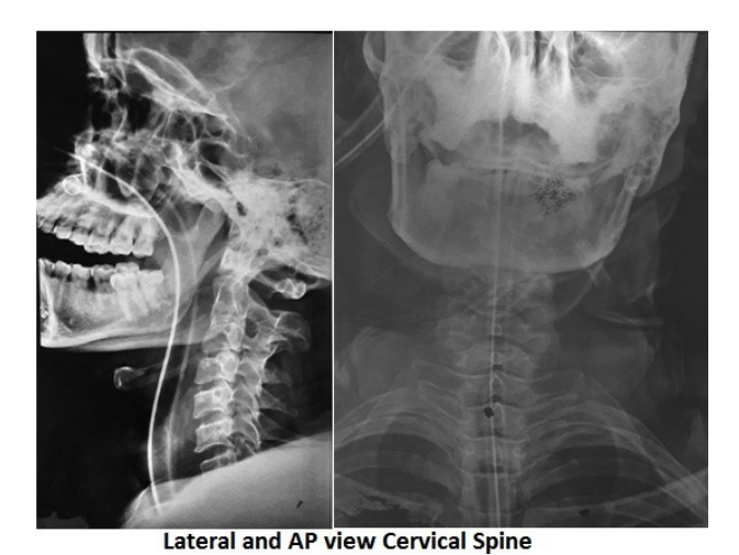
Figure 1. X-ray cervical spine with AP and lateral radiographs showing fusion of C2 and C3 vertebra. Note the presence of North-Pole ETT.