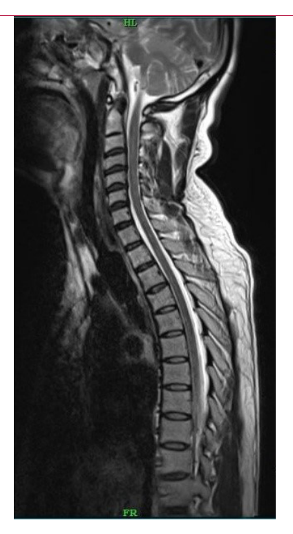
Figure 3. Normal MRI spine of the patient.

Hanging is by far the most common mode for suicide in India. 51.5% (69 306 of 134 561 cases) of individuals opted for hanging during 2018 (3). Hanging is also the most common method of judicial executions worldwide. The procedure is considered the most humane method (4). Mechanism of death in hanging includes asphyxia, apoplexy and fracture of cervical vertebra or a combination of these. Early resuscitation of these patients in the ED may reduce mortality and improve neurological outcome. Prognosis mainly depends on the GCS at arrival, hypotension, anoxic brain injury and hanging time (5).