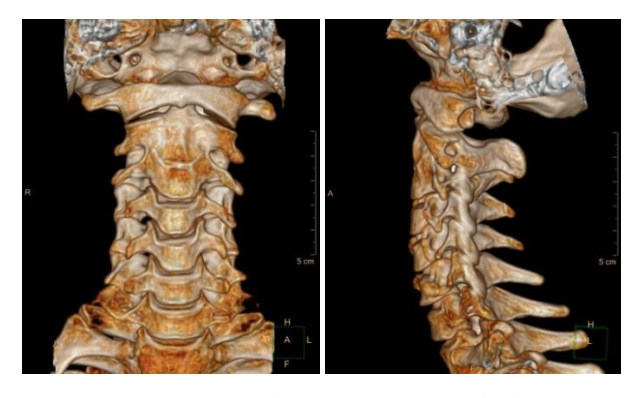
Figure 4. 3D reconstruction of cervical spine showing the fused cervical vertebra.

The most common injury to the cervical column is the fracture displacement of axis (C2) leading to spinal cord disruption. This condition is referred to as the Hangman's fracture although being a Hangee's fracture. The disruption of the spinal cord leads to a state of hypotonia which along with the weight of the victim accentuates the force of ligature. This force causes the constriction of the neck vessels leading to cerebral anoxia and death. The presence of vertebra critica was the uniqueness of our case, which may have protected the impact of ligature force and may have avoided apoplexy and eventually asphyxia and fatal injury. This is the only case of vertebra critica till date admitted for near hanging. There have been cases of people who survived even judicial hanging but they were not studied clinically and radiologically to know the reason why they survived (4).