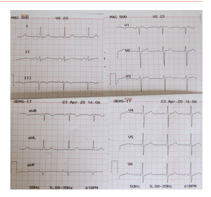
Figure 2. ECG after hemodialysis.

of mild to moderate Hyperkalemia, profound elevations of serum potassium concentrations generally produce classic ECG manifestations, but some reports are available of severe hyperkalemia (greater than 9.0 mEq/L) with ECGs not revealing the expected manifestations of Hyperkalemia. Thus, even with profound serum potassium elevations, the ECG cannot reliably be used to exclude Hyperkalemia or to monitor therapy designed to lower the serum potassium concentration (7,8).