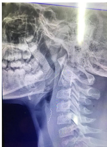
Figure 1. Lateral cervical x-ray shows a piece steel wool (arrow) in the hypopharynx region.