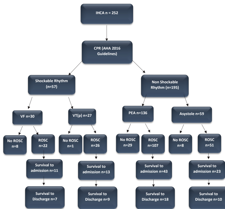
Figure 3. The relationship between initial documented rhythm and survival to discharge rate.

Conversely, in a study regarding the survival-to-discharge rates following out of hospital cardiac arrest (OHCA), VF/VT was reported as common documented rhythm (10). This decreased prevalence of VF/VT in IHCA compared to OHCA may be due to the difference in pathophysiology. The mechanism of cardiac arrest following IHCA will be hypoxia or hypotension which will present with non-shockable rhythms (11,12).