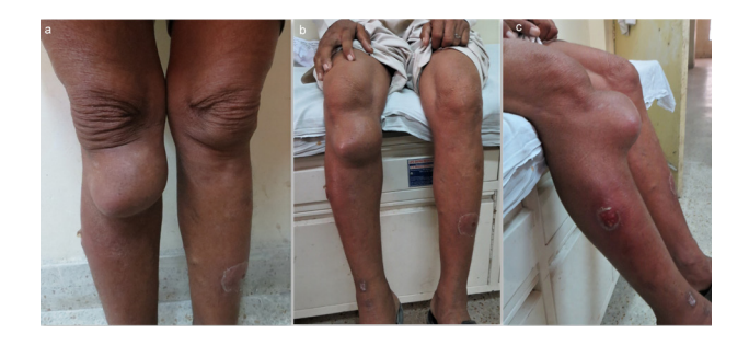
Figure 1. The clinical picture showing a huge swelling below right patella from front standing (a) and on sitting (b). The swelling is associated with adjacent cellulitis in lateral leg (c).

were unremarkable except raised total leukocyte count of 18 000/mm. The cell counts of the aspirate was found to be 53 000/mm with polymorphonuclear leukocyte predominance. Culture of the aspirate for Gram, acid fast bacillus staining and polymerase chain reaction for tuberculosis were negative. On clinical basis along with increased cell counts, the diagnosis of septic bursitis was made secondary to overlying cellulitis. Cold fomentation, rest to the limb in the knee brace, pain medication as per the requirement and empirical antibiotic therapy with intravenous ceftriaxone 1 gram resulted in recovery. In addition, amikacin 500 mg twice a day for a week followed by oral cefuroxime 500 mg twice a day for two weeks led to complete recovery over a period of three weeks with no recurrence in the follow up of nine months.